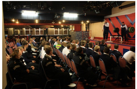
Sailors in the audience

The audience consisted of naval recruits at the final stage of their training before becoming full members of the Navy and also present were members of the training staff and the Naval Christian Fellowship. The presentation from the team was very well received.