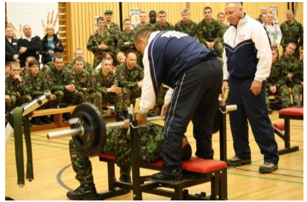
Bench press competition

Tough Talk teams have also visited the Military Correctional Training Centre in Colchester on several occasions.