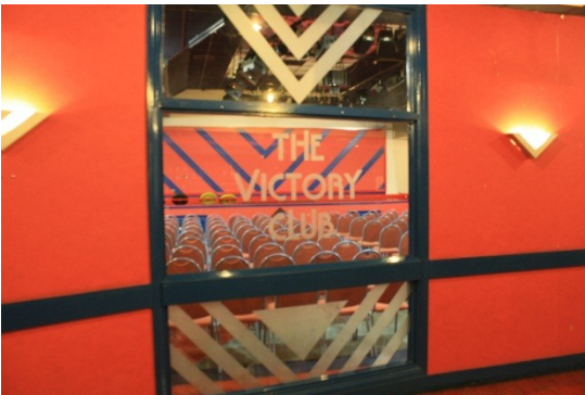
The venue: The "Victory Club

Nelson at the Royal Navy Base in Portsmouth which is at been an integral part of the city since 1194. The base is Navy's surface ships, including the aircraft carriers, Type 42 destroyers, Type 23 frigates and a mine countermeasure squadron, as well as fishery protection and training units. The initial invitation to the base was received from the Fleet Chaplaincy at HMS Nelson and was hosted by the Naval Christian Fellowship.